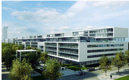
Microsoft German Headquarters, Munich