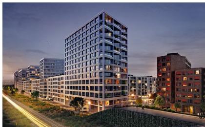
QH Track - Quartier Heidestrasse, Berlin