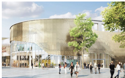
Dreiländergalerie, Weil am Rhein