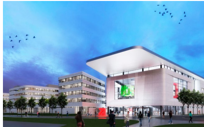
ProSieben Sat1 New Campus, Unterföhring