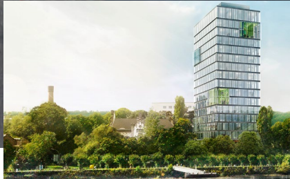
United Nations Campus, Bonn

180,000 tons of CO 2 reduction since 2000, thanks to Cobiax.