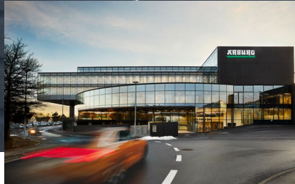
Arburg training center, Loßburg